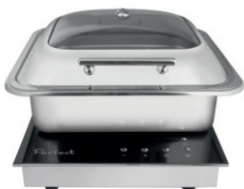
Induction Chafing Dish