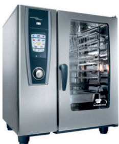
Combi Oven 20 GN PAN