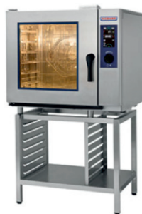
Combi Oven 10 GN PAN