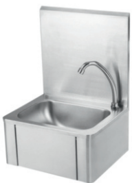
Knee Operated Sink