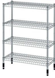
Wire Self Rack