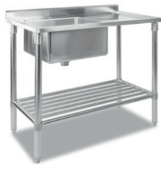
Pot Wash Sink