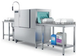
Conveyor Dishwasher Machine