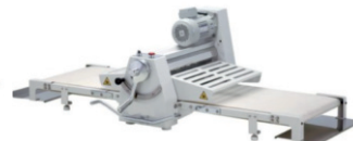
Table Top Dough Sheeter