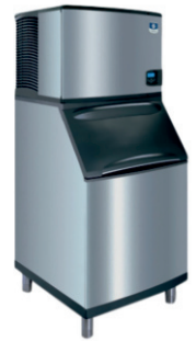
Ice Cube Machine