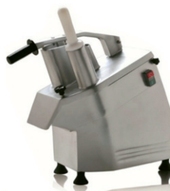
Veg Cutting Machine