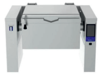
Tilting Bratt Pan