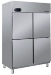
Four Door Refrigerator