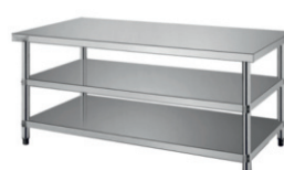
Support Table with undershelf