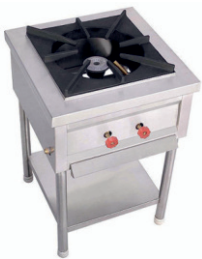
Single Burner Gas Range