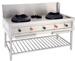
Chinese Gas Range