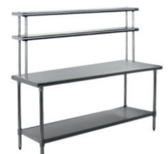
Pick Up Table with overheadshelf