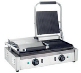
Double Sandwich Griller