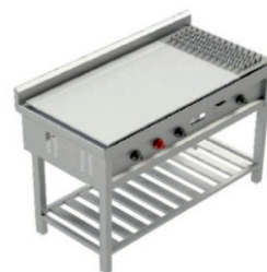
Chapati Plate Puffer