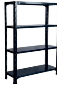
MS Storage Rack