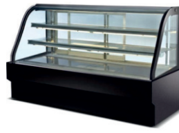
Cold Display Counter