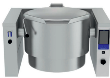
Tilting Boiling Pan