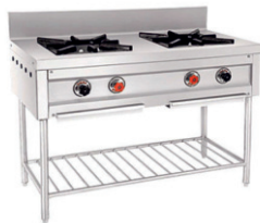
Two Burner Gas Range