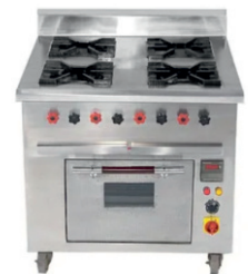
Four Burner with Oven