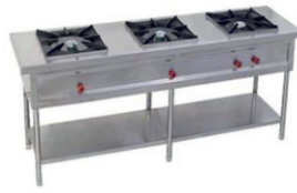
Three Burner Gas Range