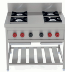
Four Burner Gas Ranges