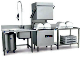
Hood Type Dishwasher Machine